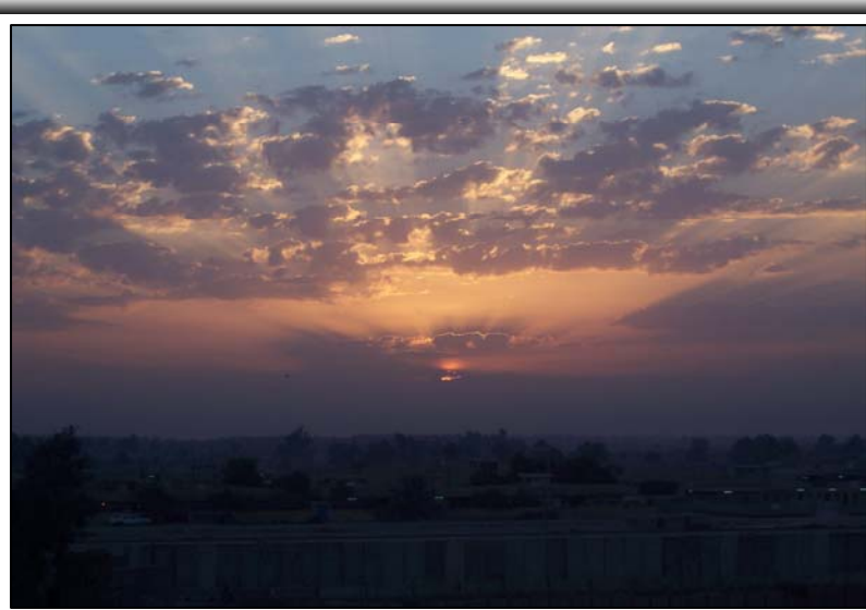
Sunset in Mahmudiya, Iraq