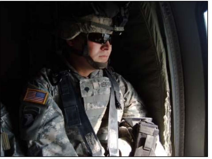
MiTT 3 – SPC Herren on a Blackhawk