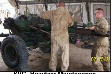
SVC- Howitzer Maintenance