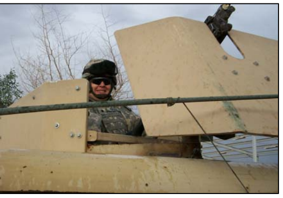
SVC – SPC HRPCHA on mounted patrol