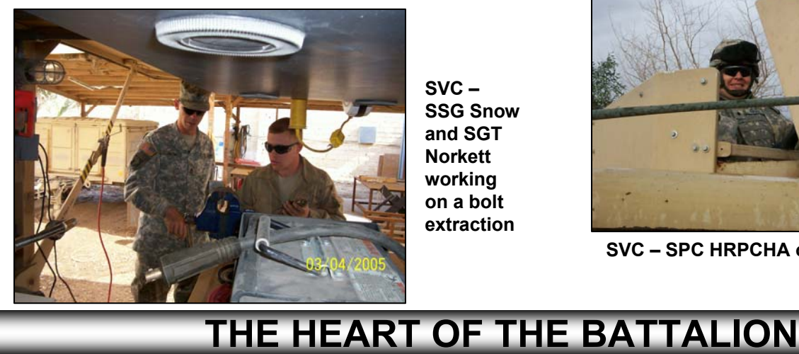
SVC -SSG Snow and SGT Norkett working on a bolt extraction