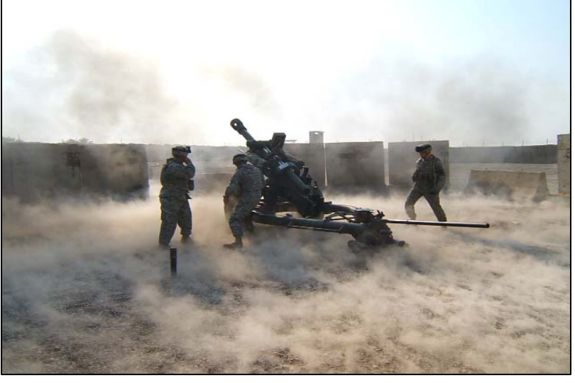
Bulls Firing platoon doing a counter fire mission